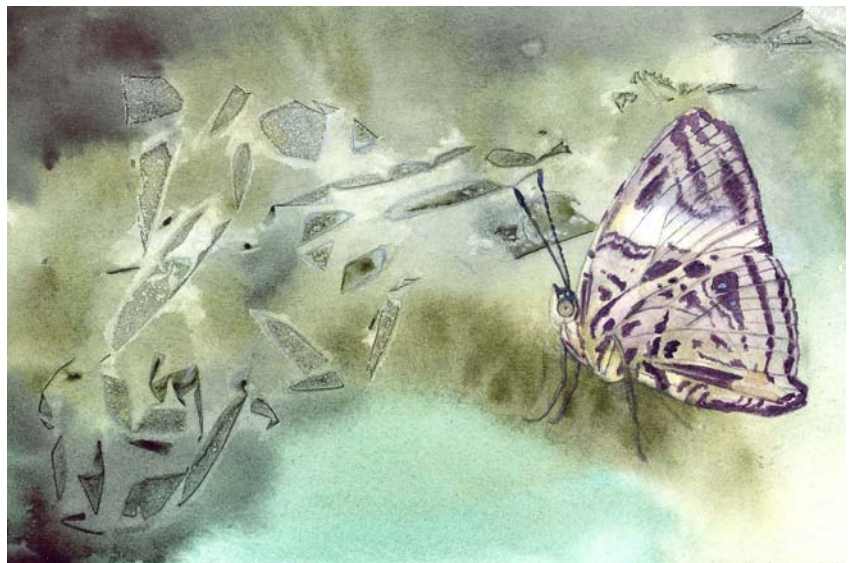
Zebra Mosaic by Judy Brown © 2007