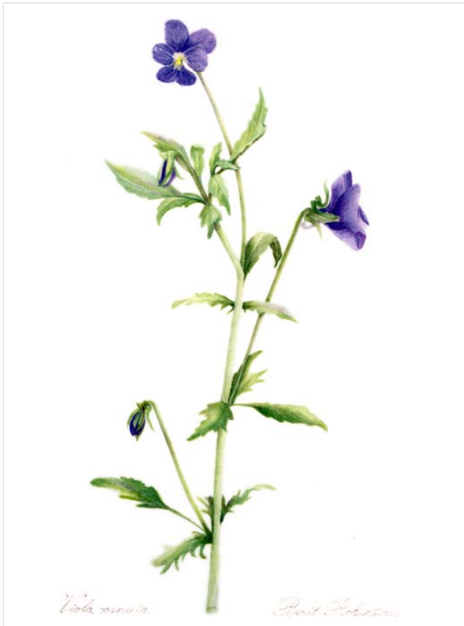
Viola Cornuta © 2006 by Berit Robertson

Filoli has an extensive educational program that ranges from introductory classes in drawing and watercolor for children to week-long, intensive workshops and botanical certificate classes taught by accomplished Bay Area and regional instructors, as well as internationally known instruc-